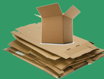
FLATTENED CARDBOARD BOXES

SEE WEBSITE WWW.DPW.DC.GOV FOR MORE INFORMATION