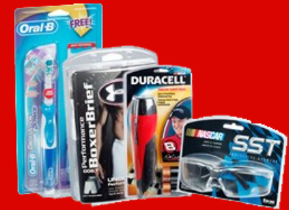
PLASTIC BLISTER PACKAGING AND CLAMSHELLS