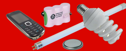
ELECTRONICS, BATTERIES AND FLUORESCENT LAMPS (TAKE TO HHW DROP-OFF)