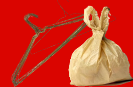
METAL HANGERS & PLASTIC BAGS (TAKE TO PARTICIPATING RETAILERS)