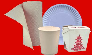
PAPER PLATES, CUPS, TOWELS, TISSUES, NAPKINS & TAKE-OUT