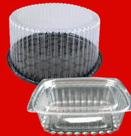
PLASTIC PRODUCE AND TAKE-OUT CONTAINERS