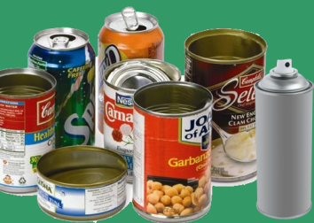
METAL FOOD AND DRINK CANS EMPTY AEROSOL CANS