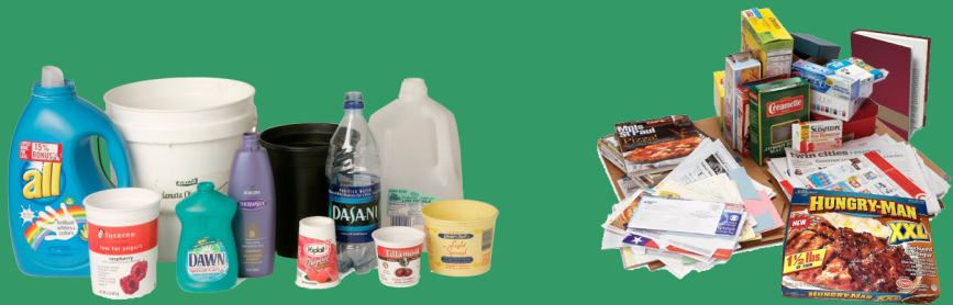
PLASTIC NARROW-NECKED BOTTLES PLASTIC WIDE-MOUTHED CUPS/JARS/TUBS