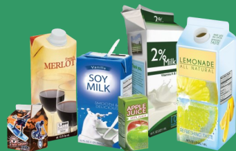
JUICE, MILK, WINE, ETC. DRINK CARTONS