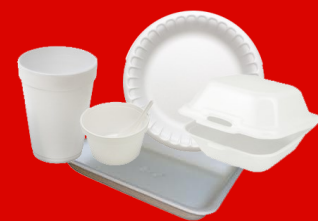
POLYSTYRENE CUPS, PLATES, PACKAGING